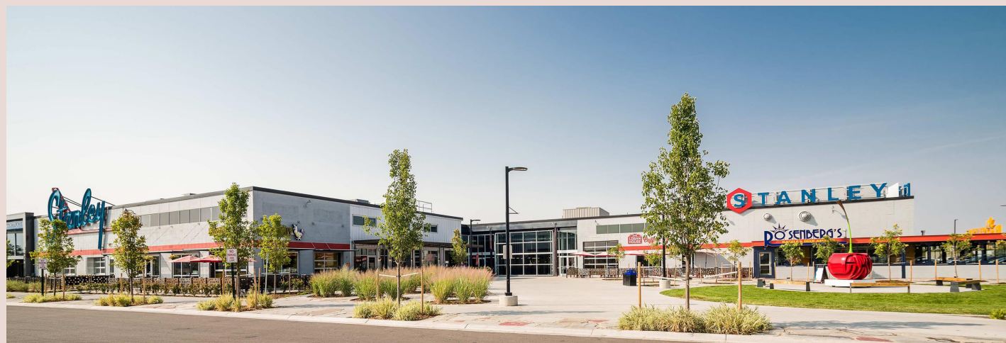
Shop and dine at the Stanley Marketplace in Aurora on November 5.

11/20 Mon • Dinner Out "Cheddar's Scratch Kitchen" • Northglenn • 1 Enjoy American comfort food with a Texas twist. Dinner cost separate. 4501.306 4:30-8p.m. $7/$8